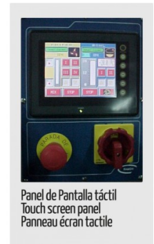
Panel de Pantalla táctil Touch screen panel Panneau écran tactile